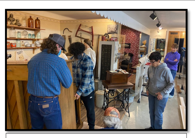
Thank you high school seniors for helping us moving the heavy objects at the museum